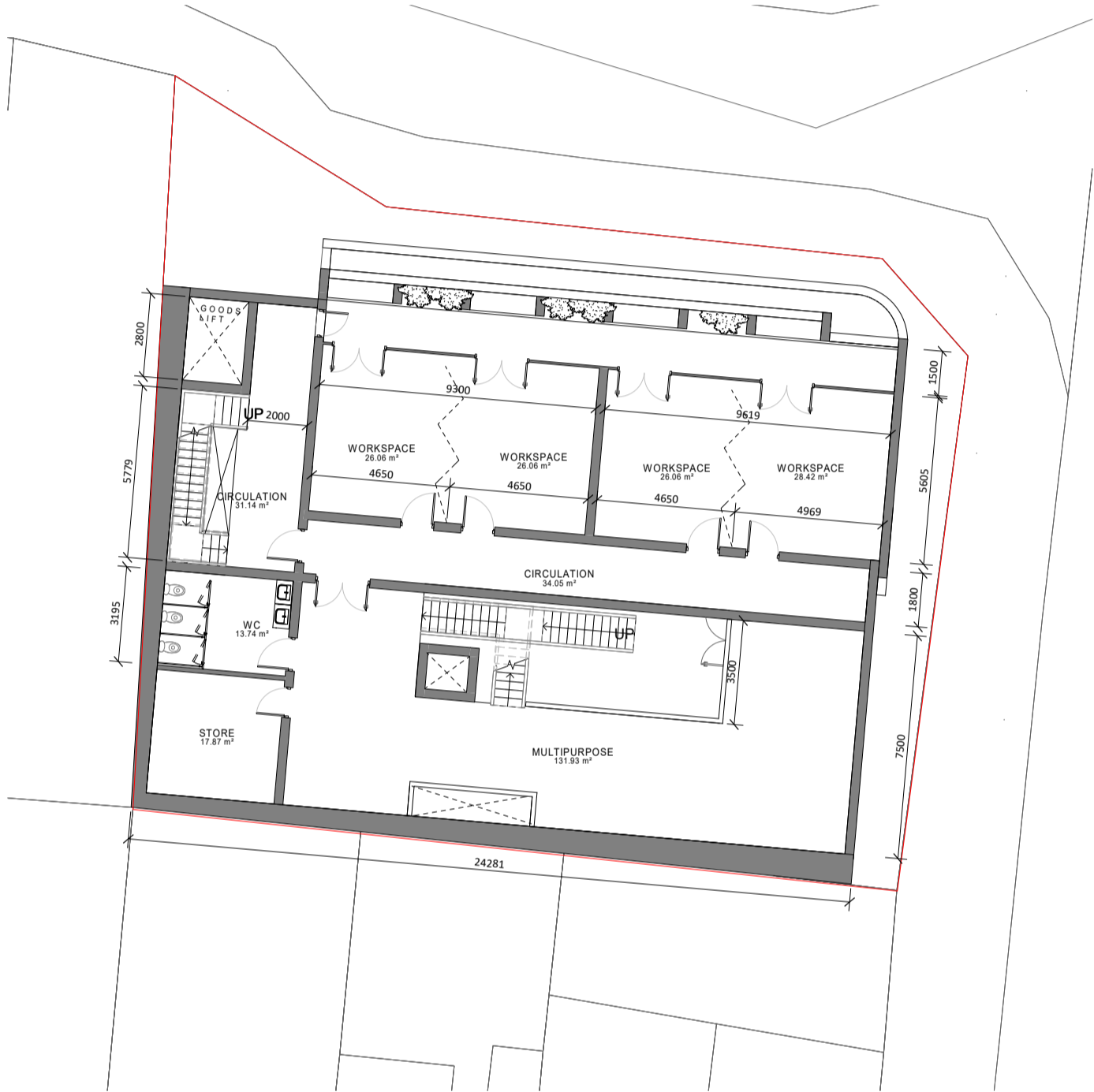
FIRST FLOOR PLAN_1:200